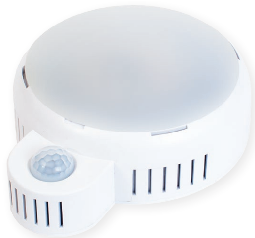
Small Space LED Luminaire (P/N: 16550)